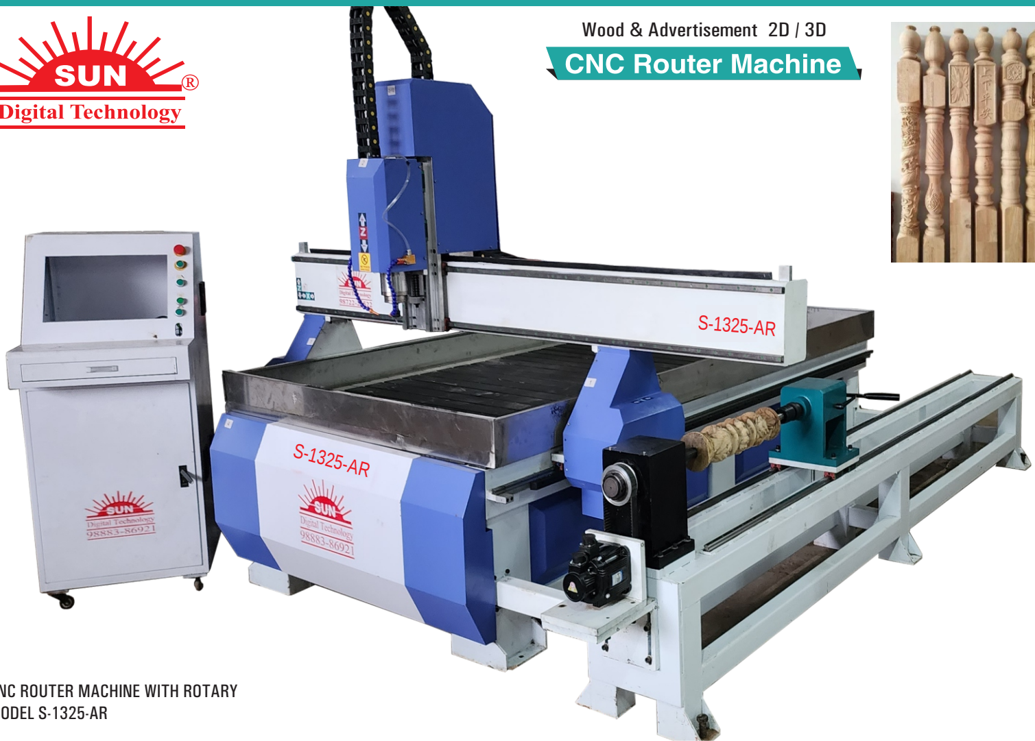
CNC ROUTER MACHINE WITH ROTARY MODEL S-1325-AR

This Machine Working on: Glass, Woods, MDF, ACP Sheet, Acrylic Sheet, Hardwood, PVC, Sheet, Korean Cutting, 2D & 3D Carving.